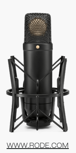
large diaphragm microphone